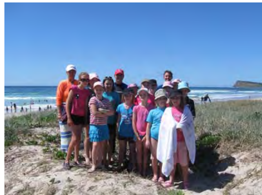
Children from the camp with volunteers from the Lennox Head Alstonville Surf Life Saving Club